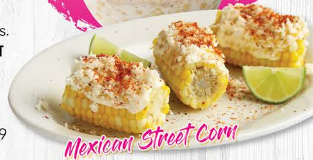
Mexican Street Corn