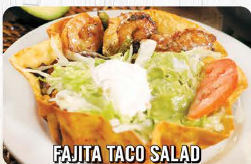
FAJITA TACO SALAD

Lettuce topped with tasty grilled chicken, steak and shrimp, diced tomatoes, shredded cheese, sliced jalapeños and cucumbers. 13.55