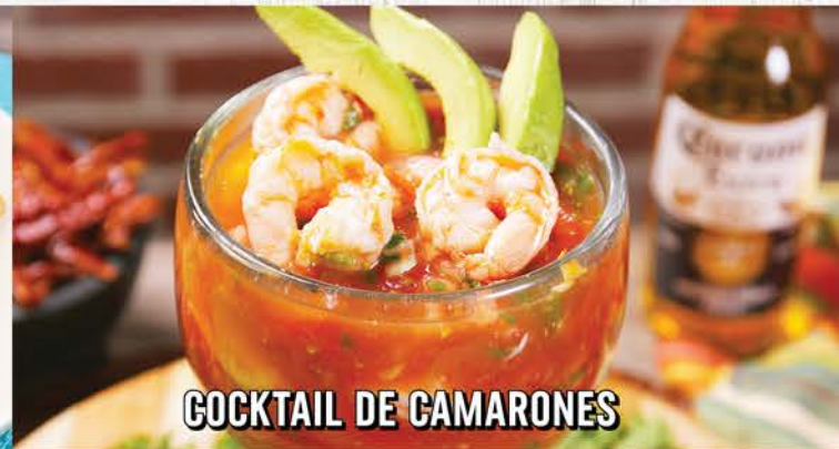
COCKTAIL DE CAMARONES